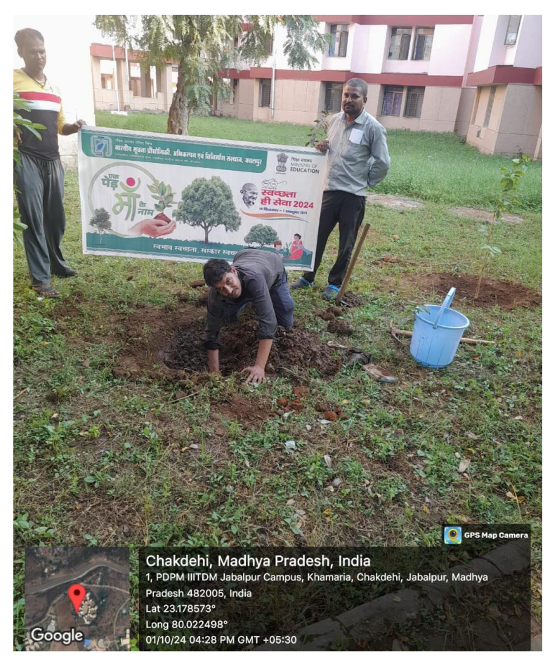
Image 10: Hostels employees planting samplings at IIITDM Jabalpur.

This activity involved planting saplings inside the hostels. A number of new plants were added to the already existing greenery of the IIITDM Jabalpur hostels. A representative picture is given below.