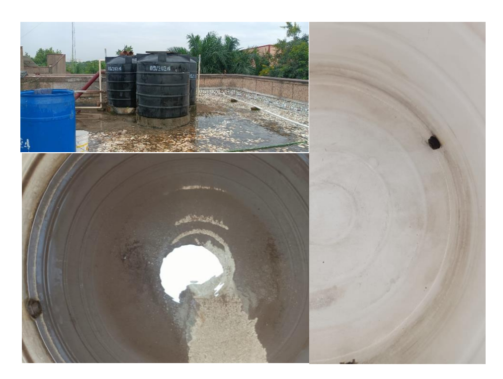
Image 11: Some before and after pictures of the water-tanks undergone sludge cleaning.

Institute works department of IIITDM Jabalpur utilized this opportunity to get the overhead tanks of the residentials as well as academic buildings cleaned. The tanks had collected sludge reaching from the high-level of sediments in the ground water. The tanks were thoroughly cleaned to improve the quality of water used by the institute employees and students.