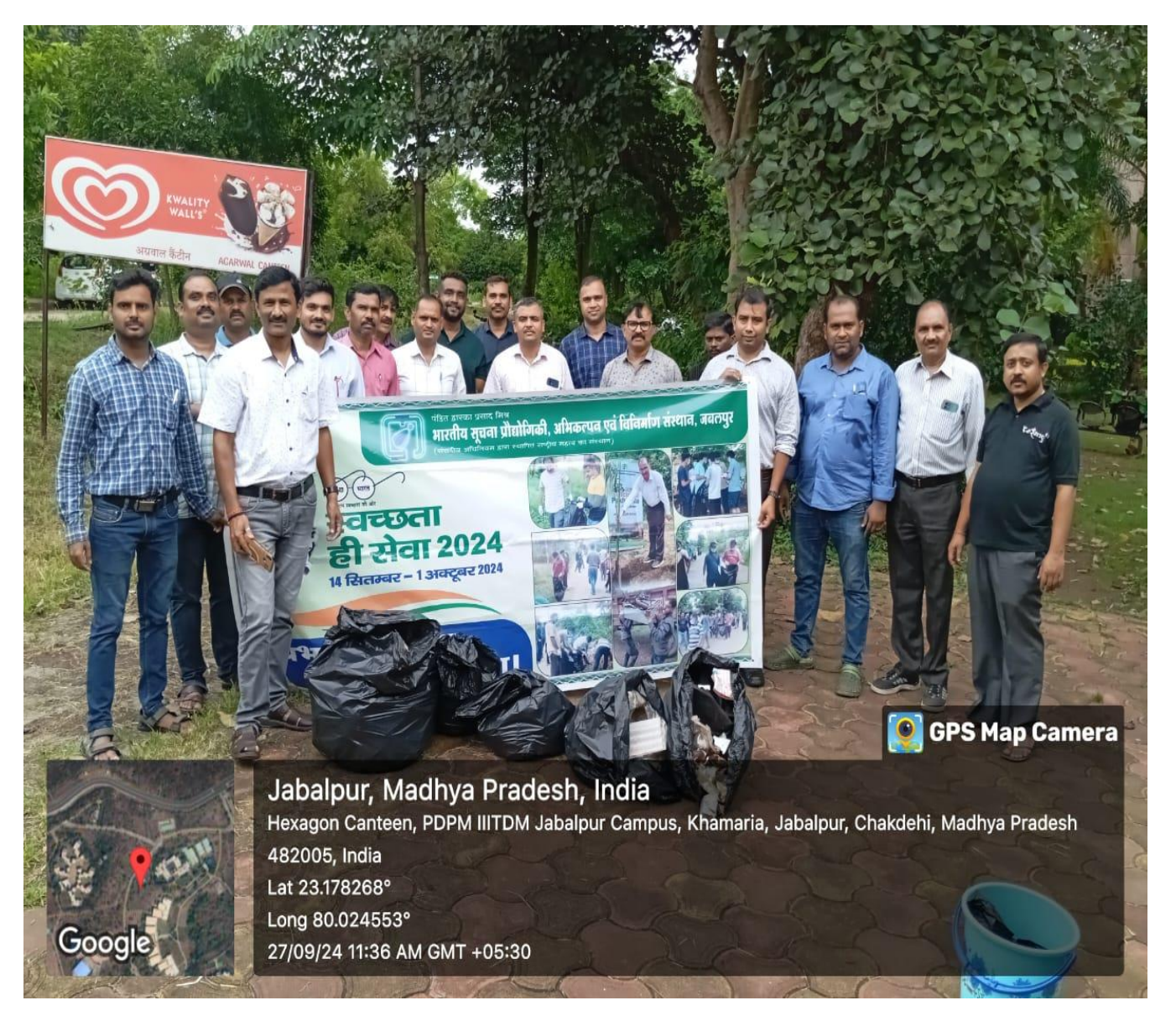
Image 7: A group photo taken at the end of the swachhata walkathon.