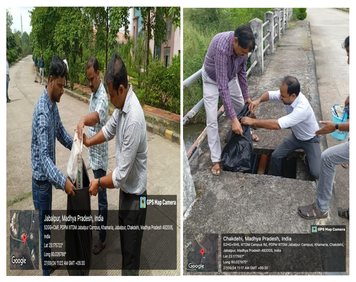
Image 6: Some pictures of the swachhata walkathon performed at IIITDM Jabalpur.

This activity saw several staff, and faculty members coming together to take a walk around the administrative and academic area of IIITDM Jabalpur, and simultaneously collecting the plastic waste along the path. The activity lasted more than an hour. Through this activity, a sense of the collective efforts was also rejuvenated among the employees, who happily had a cup of tea together at the end of the event. Some of the representative pictures of the activity are given below.