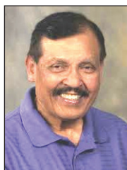
Prof. R. N. Mohapatra

The symposium covers broad spectrum of topics related to the several applications of mathematics in real life, integral equations, engineering and sciences. The interest areas of the programme are as follows : Applied mathematics, integral equations, Analysis with applications, etc.