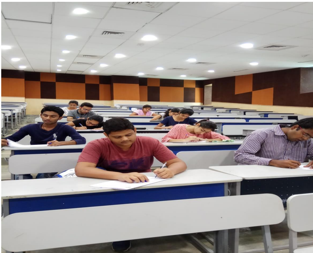
Essay Writing Competition