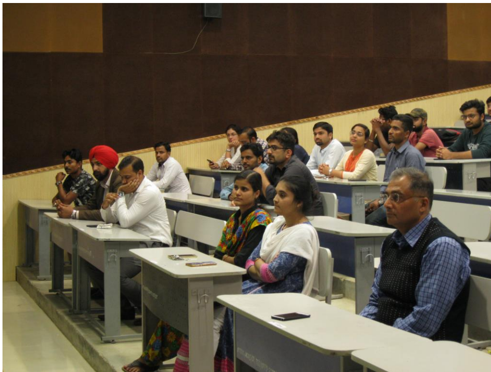
Closing ceremony, L-201 (LHTC)