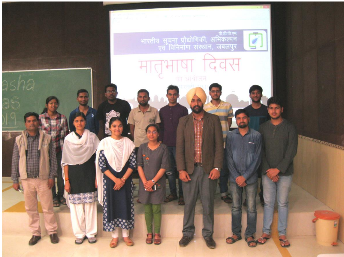
Group Photo's during the Closing Ceremony